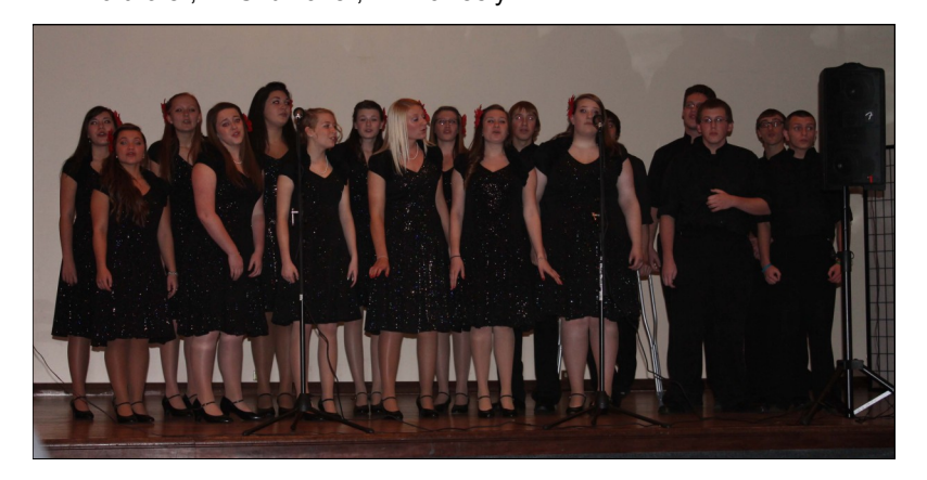
Cloverleaf Swing Choir